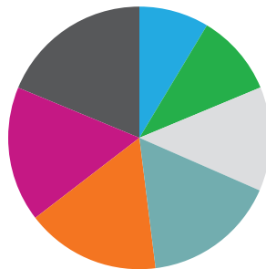
Interior Design Professional Exam (IDPX) 175 Questions | 4 Hours to Complete