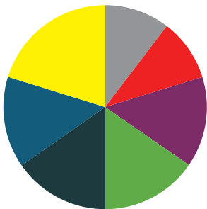
Interior Design Fundamental Exam (IDFX) 125 Questions | 3 Hours to Complete