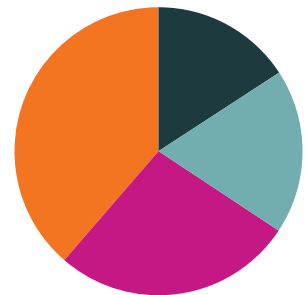
Practicum Exam (PRAC 2.0) 120 Questions | 4 Hours to Complete